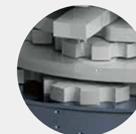
Ring Mill Optional ring mill equipped for grinding and rolling the material into clean, dense nuggets suitable for transportation.