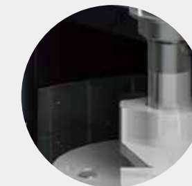
Chamber Liners Durable, wear resistant, replaceable chamber liners for long service time.