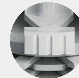
Hammer Breaker Heavy duty hammer breaker for smashing material