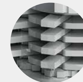
Hammer Mill Optional hammer plate equipped for smashing bulky material and liberate different types of material.